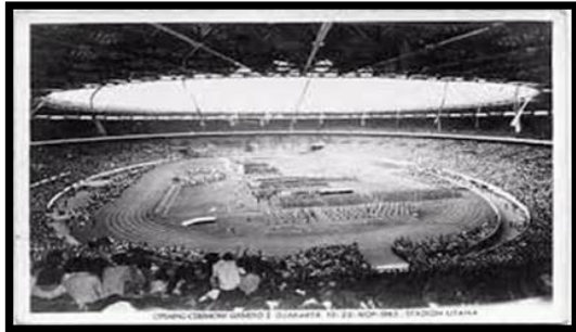
Fig. 2. Opening ceremony of GANEFO 1963.

to an end on November 22. In spite of a sudden downpour the final day saw a cheering crowd of 150.000 on hand to watch the parade of 2200 athletes from Asian, African, Latin America and European countries while national flags flew amidst the glow of myriad of floodlights. [Fig. 2] The keynote of the parade- and GANEFO itself –was to be found in one of the huge slogans that draped the grandstand in the main stadium of the Gelora Bung Karno sports complex [2], the enormous 10 million dollar sport complex which had been constructed with Soviet aid [4]. “Onward, No Retreat!”